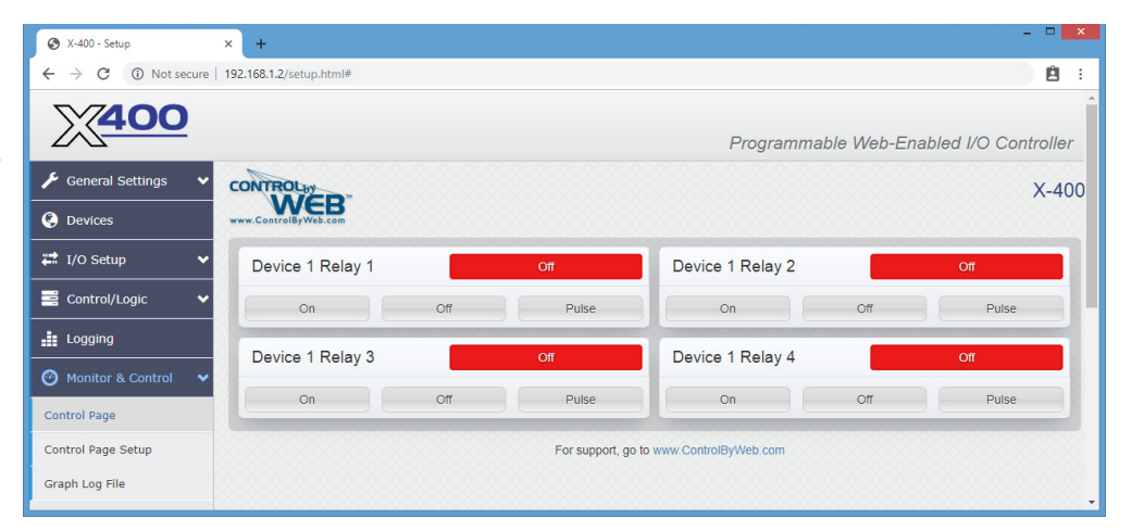
View X-21s components on the X-400's Dashboard