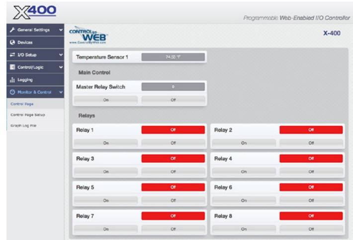
Web-Based Control Page Example