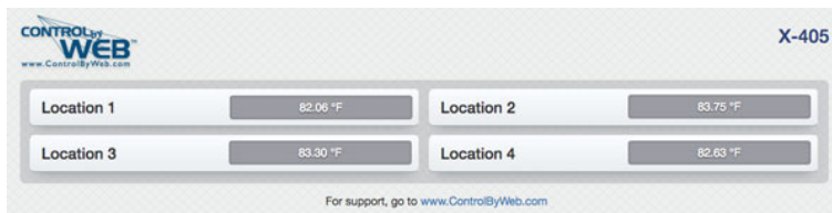
Example Control Page