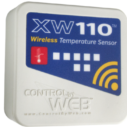
XW-110 Plus Bottom View

For technical support, email questions to: support@ControlByWeb.com